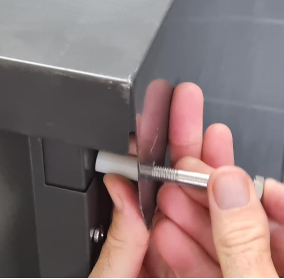
6. Repeat bolt/washer/nut for lid