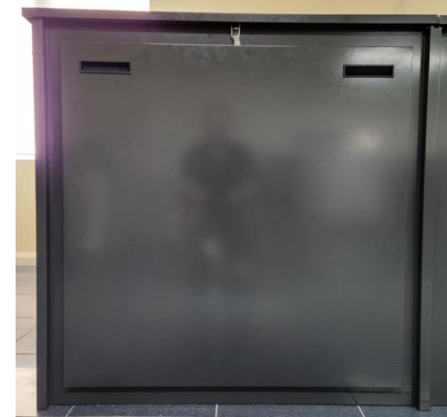
17. Installation complete