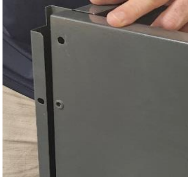
2. Join side panel into rear panel