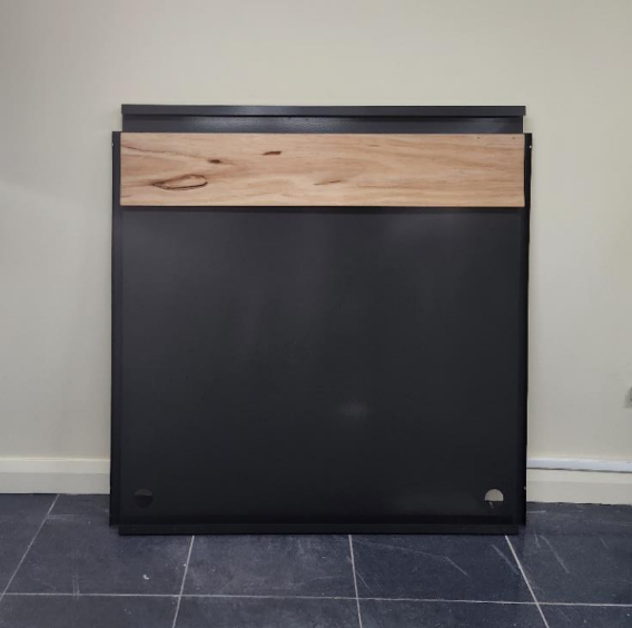
1. Position rear panel