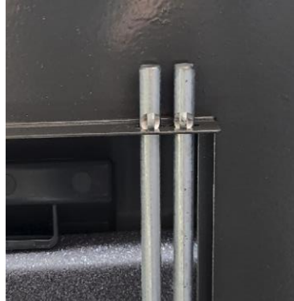
16. Store door stay inside front panel when box is closed