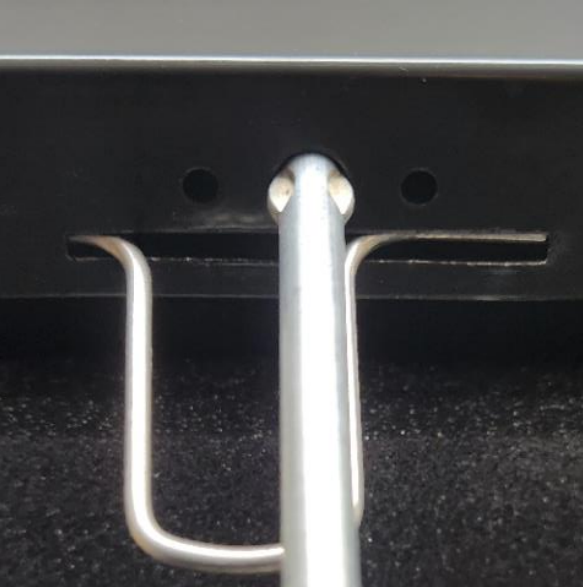
14. Insert door stay into hole in underside of lid to hold open