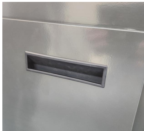
11. Position door into front panel