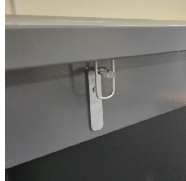
9. Screw latch onto front panel