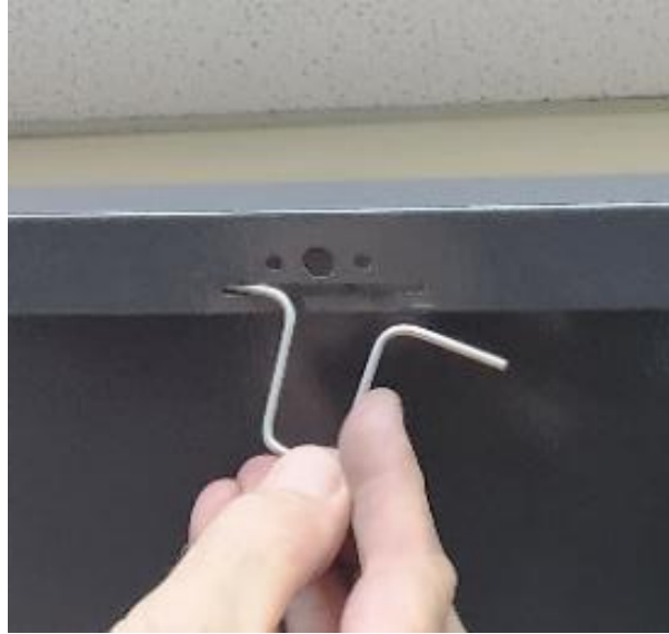
7. Insert latch hook into underside of lid