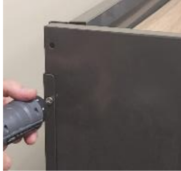
3. Join side to rear panel with 2x M6 screws, repeating for other side