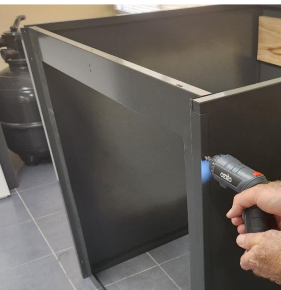
4. Join front panel to side panel with 2x M6 screws, repeating for other side