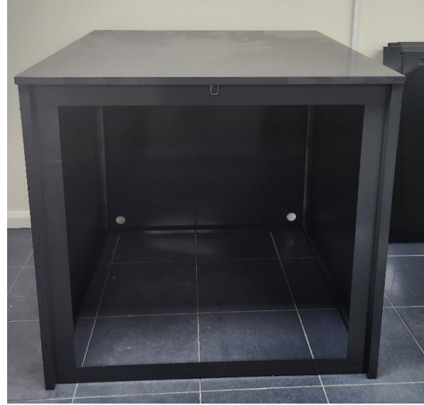
8. Confirm lid is square with box