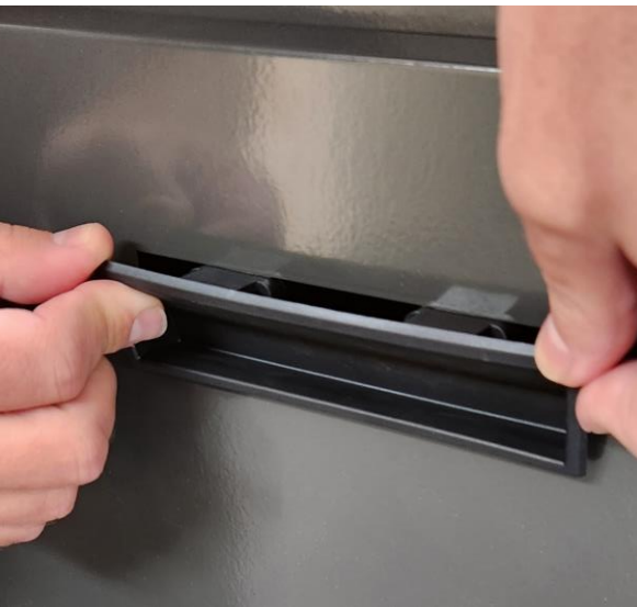
10. Insert handle into door until you hear a click