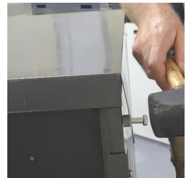
5. Centre box to ensure square and place lid on top; tap bolt & washer in place