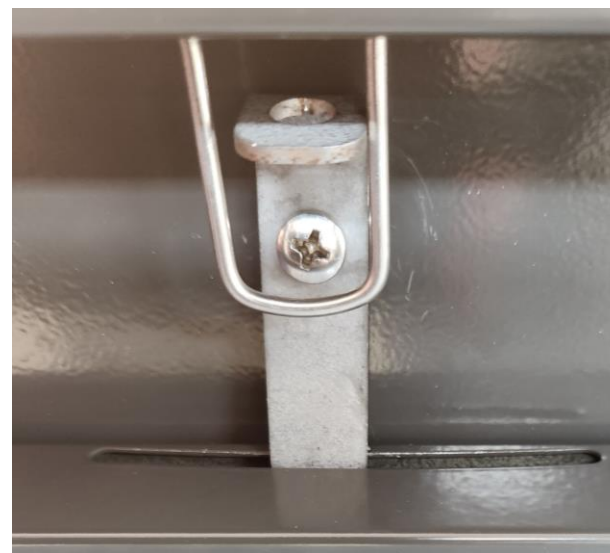
12. Insert latch into door to hold in place