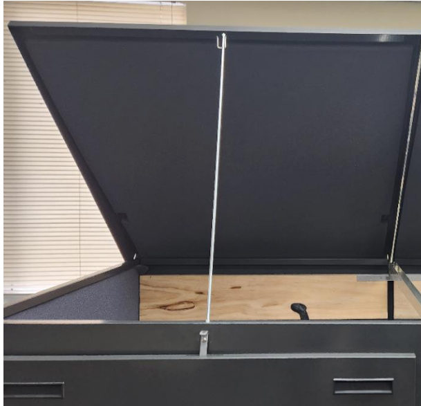
15. Door stay holds lid open when connected to both holes