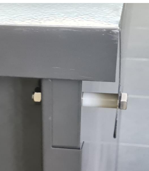
17. Secure bolt using nut