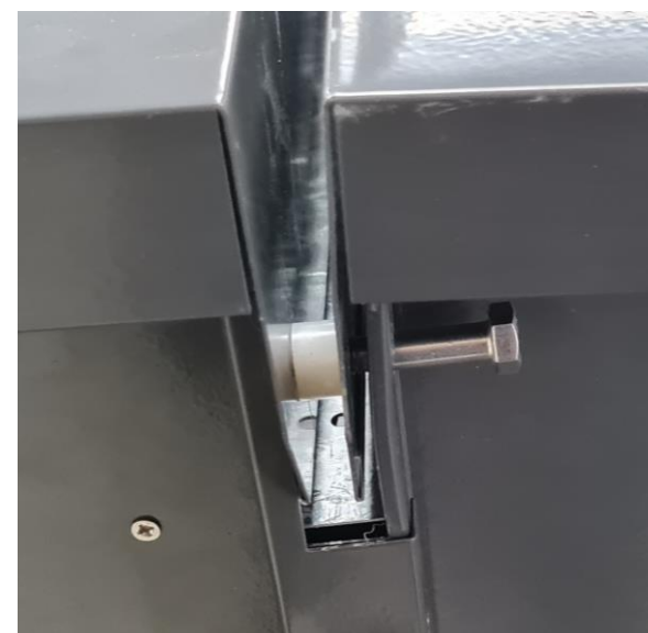
19. Insert bolt through lid 1, join channel, then into washer