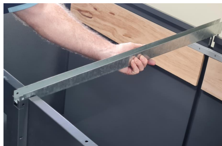
13. Position join channel between front and rear panels