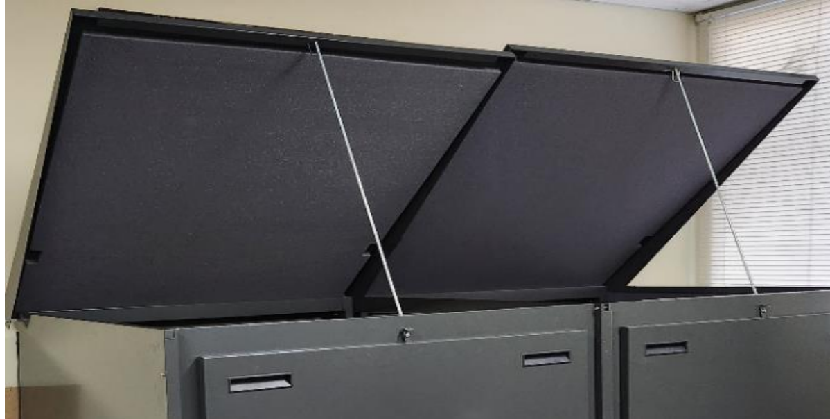
30. Door stay holds lid open when connected to both holes