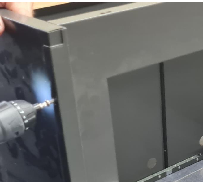
11. Join side to front panel with 2x M6 screws, repeating for other side