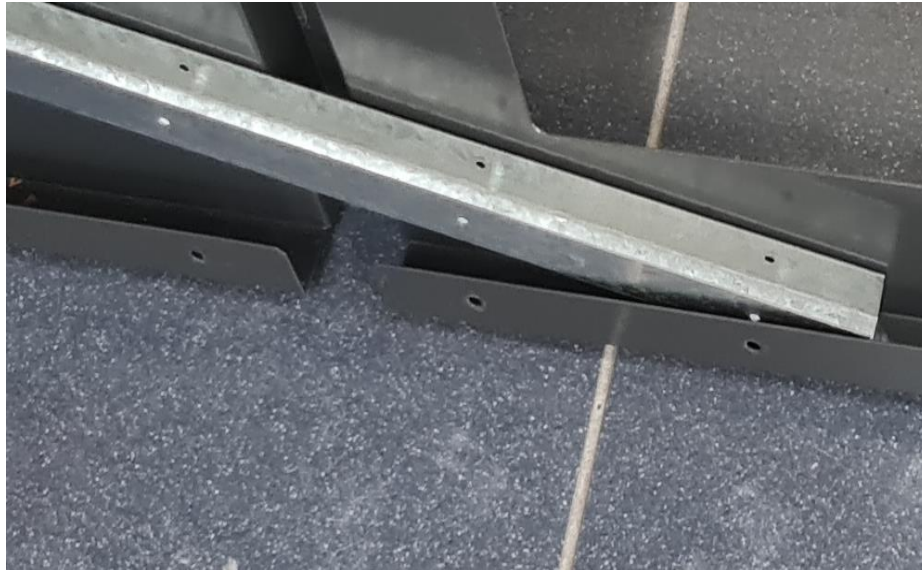
2. Slide bottom channel into slot at base of rear panels