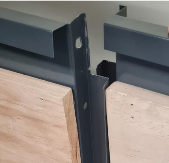
1. Insert one rear panel into the other