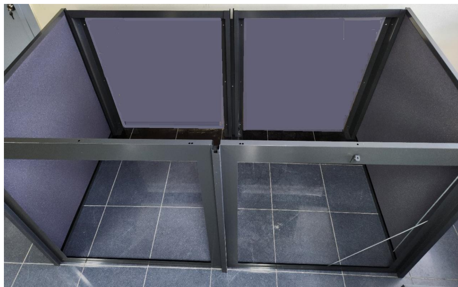
12. Position box to ensure square