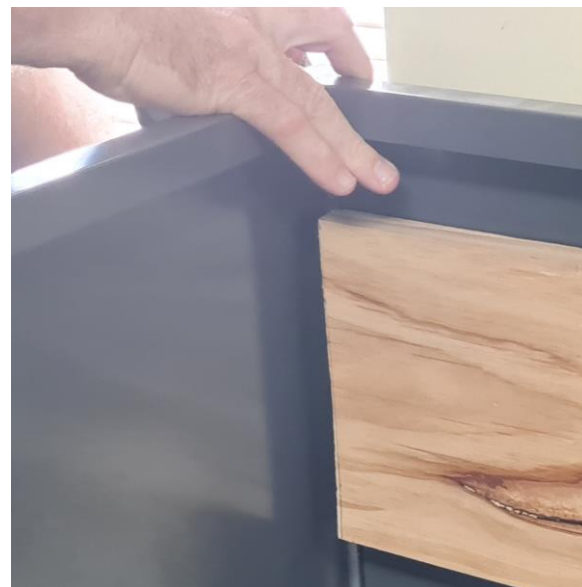
5. Slide side panel into rear panel