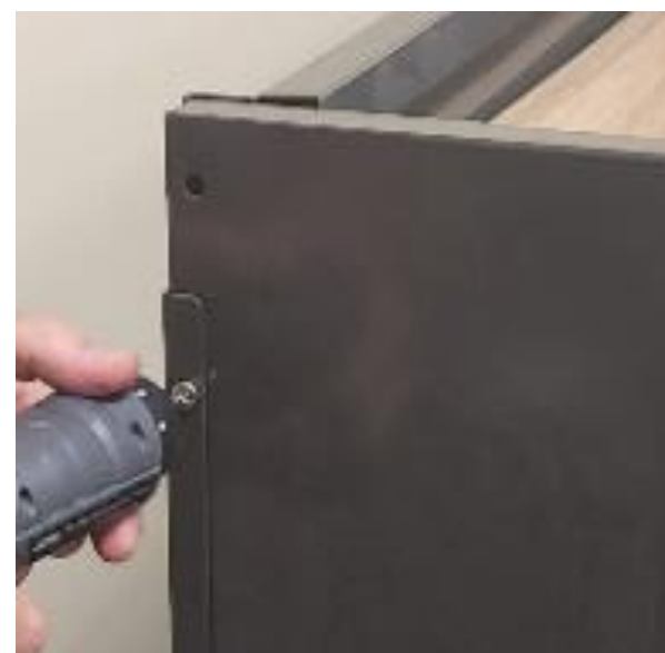
6. Join rear panel to side panel with 2x M6 screws, repeating for other side