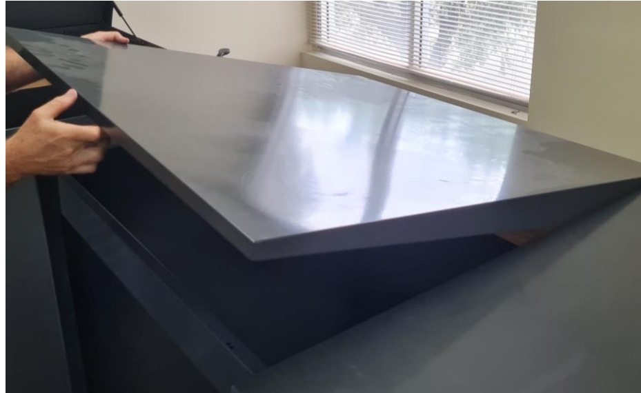
15. Position 1 st lid and ensure lid is square with box