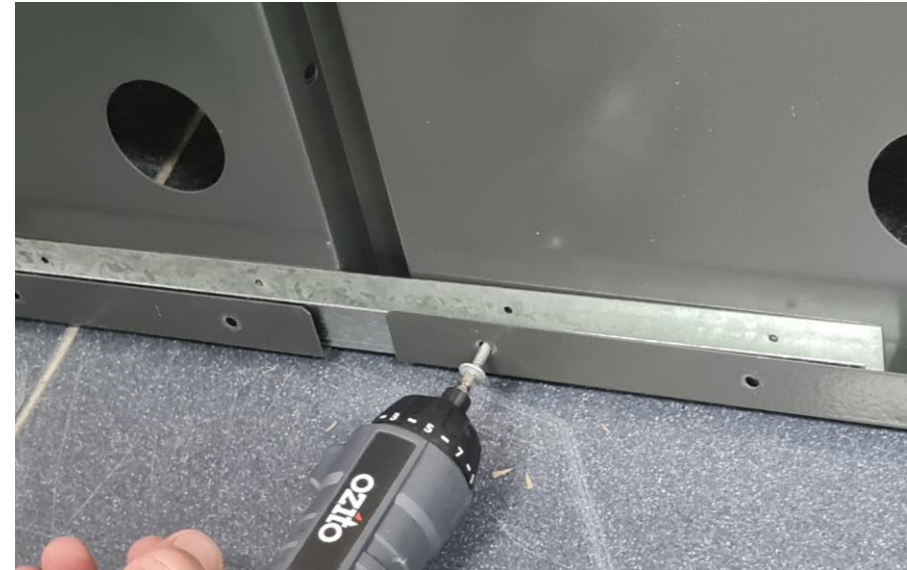
3. Secure channel to rear panels us 4x tap screws