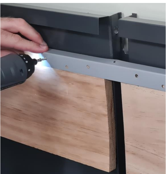
4. Secure top brace to both rear panels using 4x tap screws