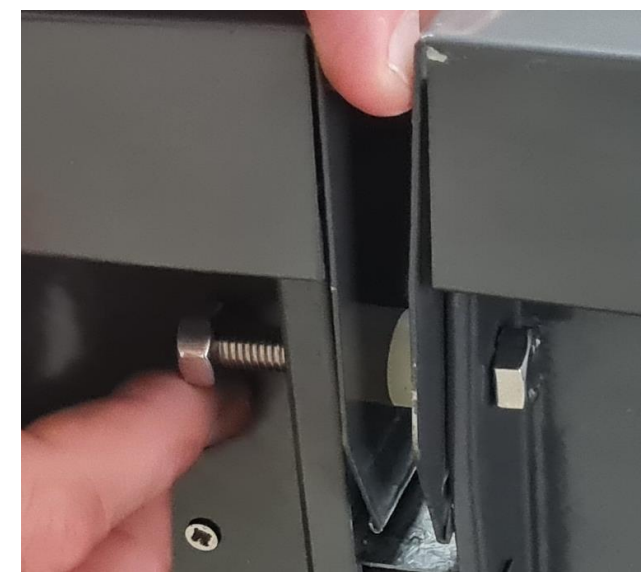
20. Insert bolt through joint channel and 2 nd lid, secure with nut