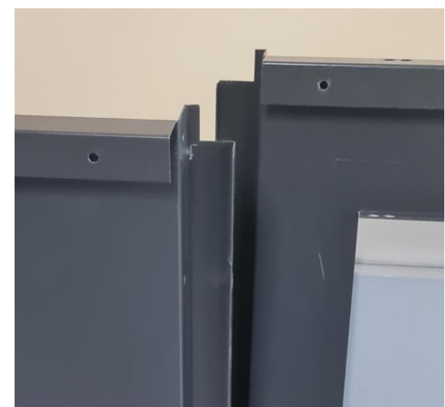
7. Slide half or full front panel into corresponding front panel