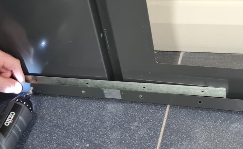
9. Secure bottom channel to front panels using 4x tap screws, as per step 2