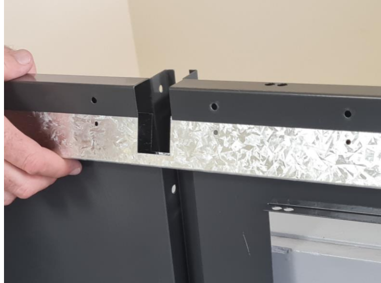
10. Slide top support channel into top of both front panels