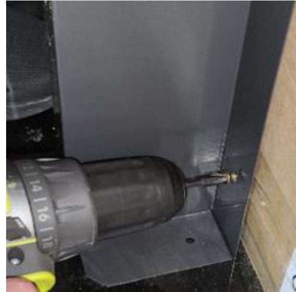
3. Loosely secure wall strip to wall