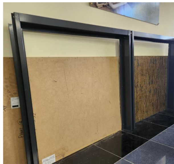
6. Ensure both sets of wall strips and bridges are square & secured to wall