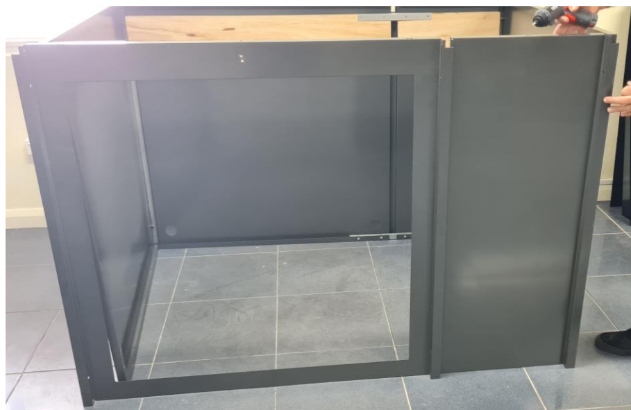
13. Position box to ensure square