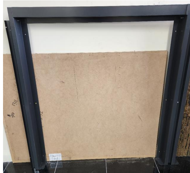
2. Place wall strip/bridges against wall