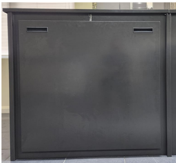
27. Position door inside front panel