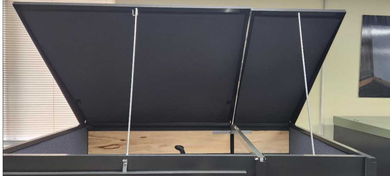
31. Door stay holds lid open when connected to both holes