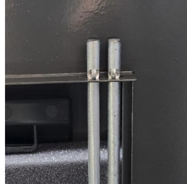
32. Store door stay inside front panel when box is closed