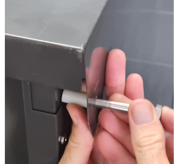
17. Insert bolt through lid, then through large washer, and into (larger) side panel