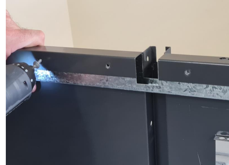
11. Secure top channel to both front panels using 4 x tap screws