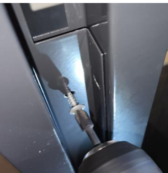
5. Slide middle wall strips together & secure together using tap screws