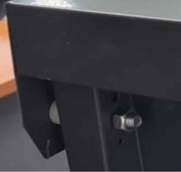
22. Secure 2 nd lid with bolt/washer