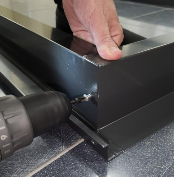
1. Use tap screws to secure bridge to wall strips, repeat on other side