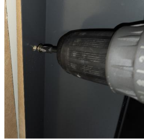
4. Loosely secure wall strip (3 points) using screw or bolt if brick wall