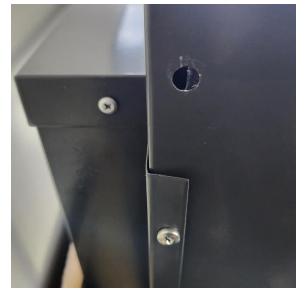
8. Sides now connected to wall strips/bridges