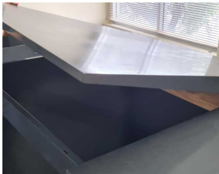
19. Position 2 nd lid and ensure square with box – if space is difficult, do after step 19