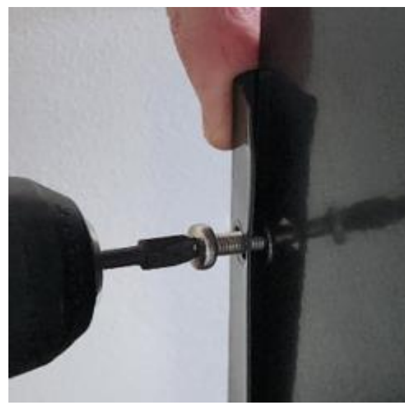
7. Connect side panel to wall strips on both sides using M6 screws