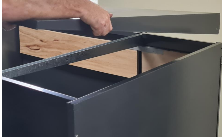
16. Position 1 st lid and ensure lid is square with box